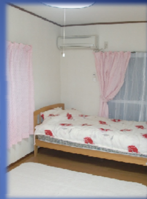
Room Share Program