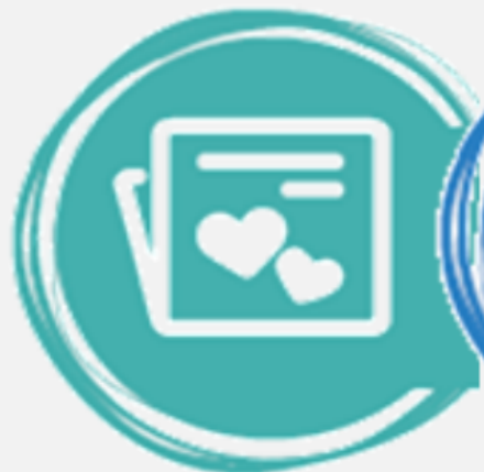
Words of Affirmation

READINGGRAPHICS ACTIONABLE INSIGHTS IN ONE PAGE