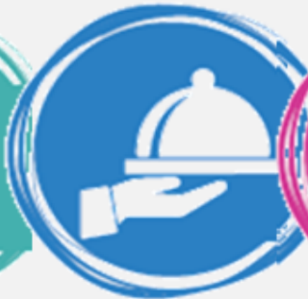
Acts of Service