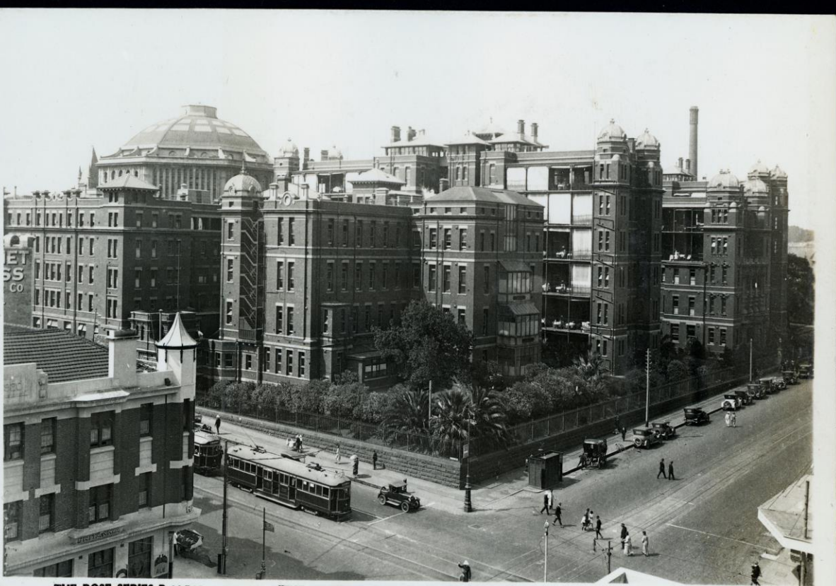
THE ROSE SERIES P. 10711 COPYRIGHT.