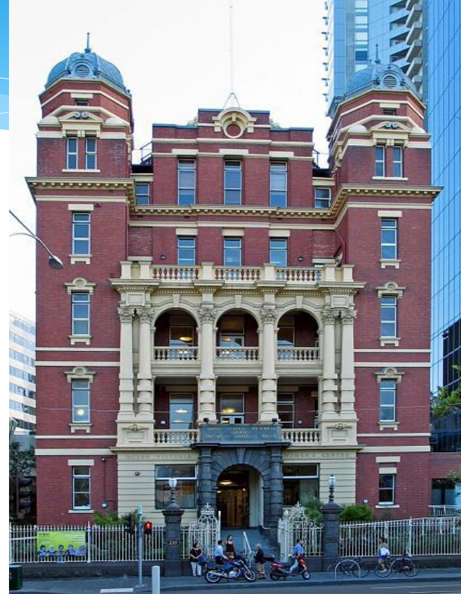
THE HOSPITAL BUILDINGS, MELBOURNE, VIC.