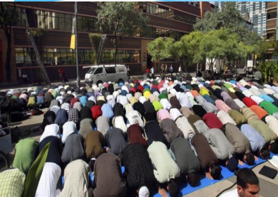
RMIT 14 March 2008