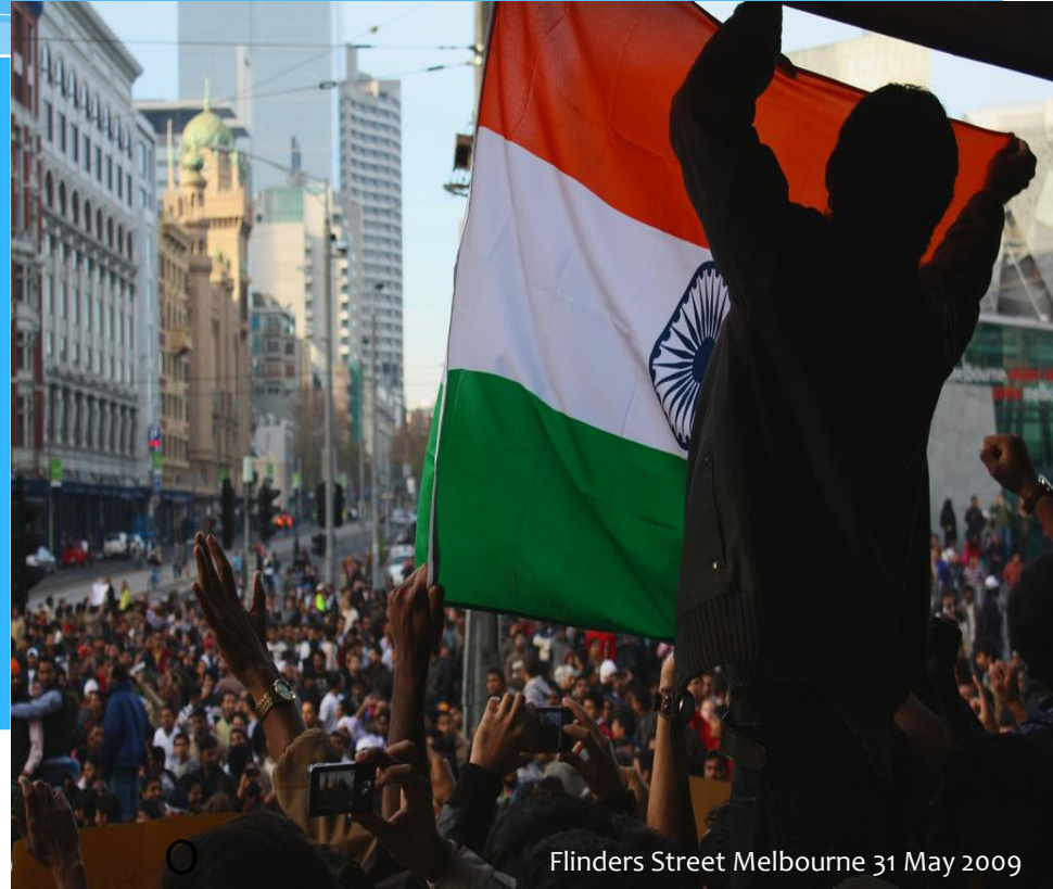
Flinders Street Melbourne 31 May 2009