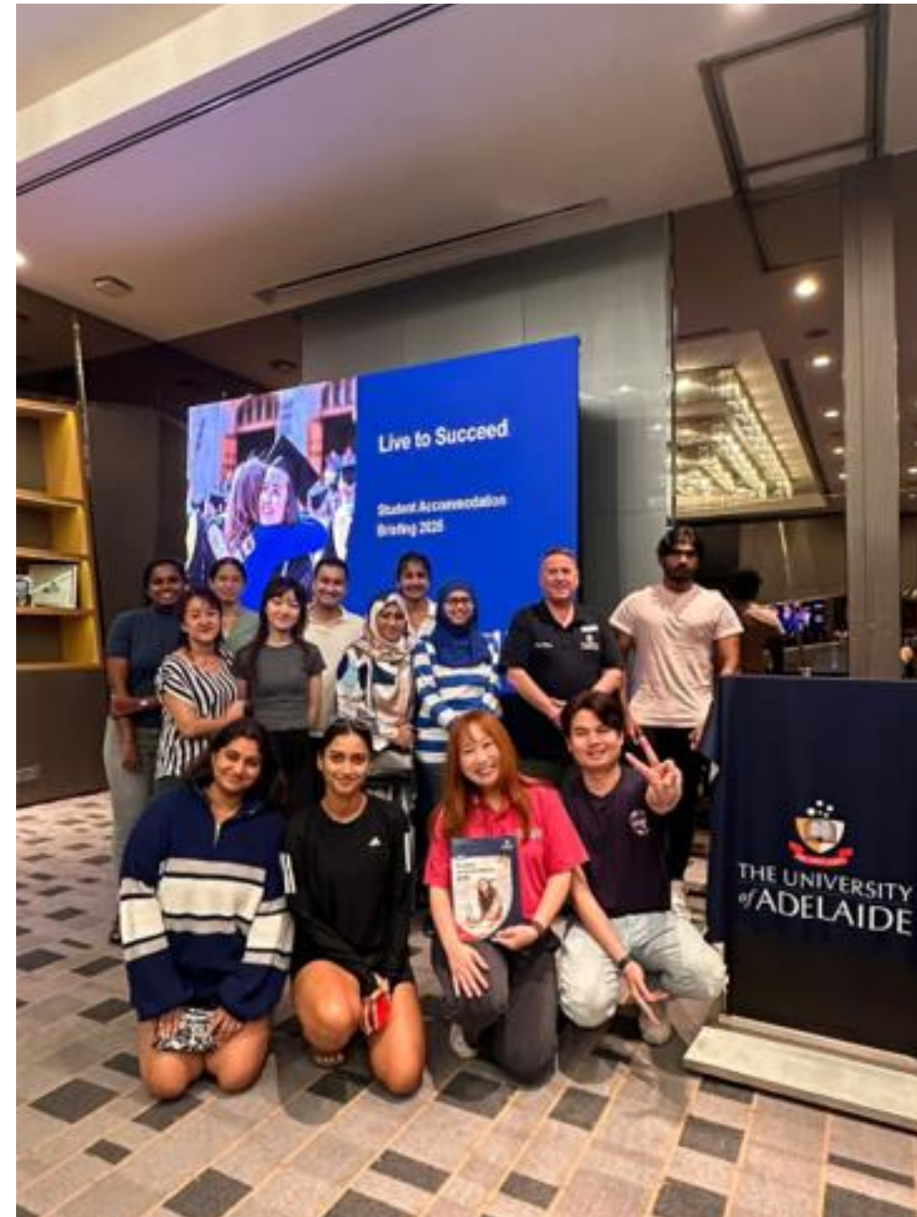
Live to Succeed Singapore Student Event October 2024

Taking the University's message to key international markets